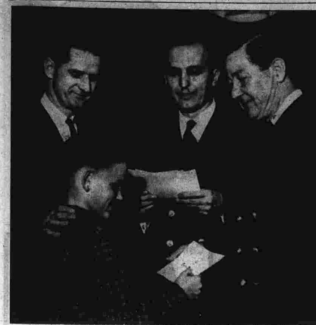
Young Grad Gets Piloting Diploma

Persons who plan to burn trash or leaves should attend their fires from 12:30 p. m. to 1:30 p. m. on Monday at 125 p. m. off Charter Oak St. Town House Co. 4.