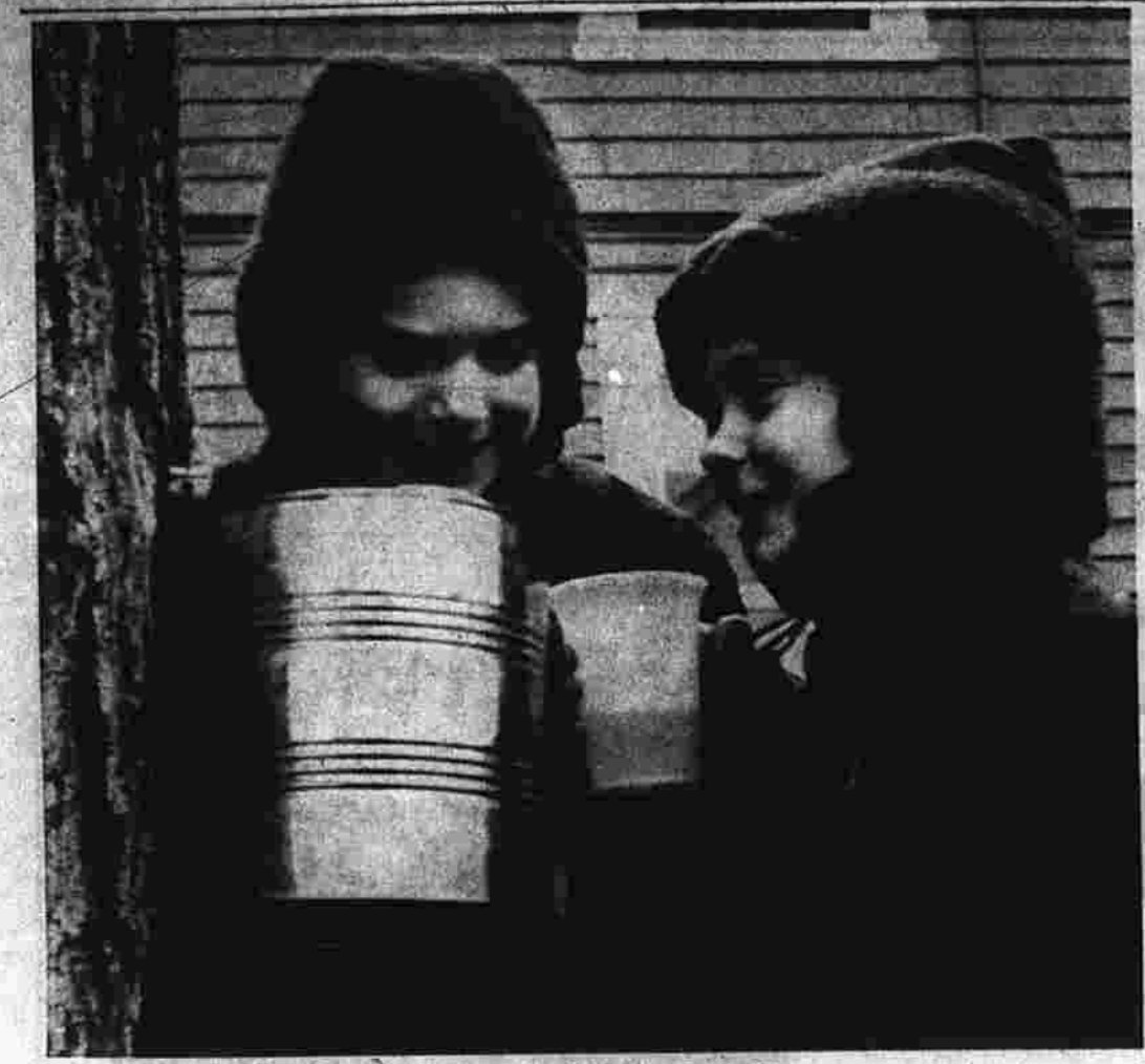
Sweet Symbol of the Season